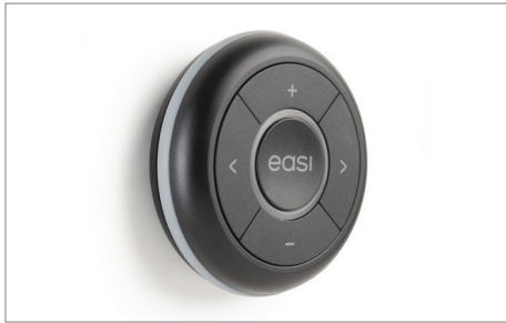
EASi DISK self-powered radio control